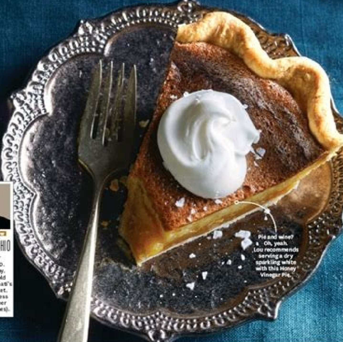
Pie and wine? Oh, yeah. Lou recommends serving a dry sparkling wine with this Honey Vinegar Pie.